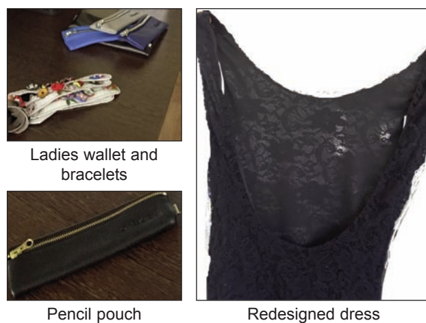
Ladies' wallet and bracelets

Organization B is mainly entered into Romanian markets for providing job and training for the Roma (Gypsies), disabled and drug addicted people. The main work of organization B is to import used clothes from Norway and distribute it to the company owned shops after sorting. However, the organization has small facilities for up-cycling clothes for the training purpose. The up-cycling of leather is done at the professional level in the organization B. The leather jackets, trousers and other clothing material found during