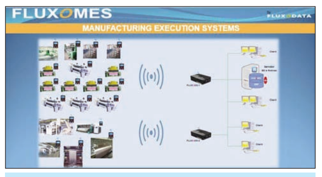
Fig. 2. FLUXOMES, manufacturing execution system from FLUXODATA

chains and business models", "Circular Economy and Resource Efficiency" and, finally, "High value added solutions for attractive growth markets" [9].