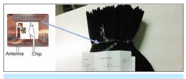
Fig. 3. Batch with RFID tag

The cutting room has a CAD software to prepare the cutting plan according the customer order. The CAD workers place the different pattern pieces in the cutting plans and prepare the markers with the best solution (fabric usage, cutting time and productivity). With digitisation is possible to select the most suitable fabric rolls, reducing the fabric leftovers and finding the best width to achieve fabric savings. Spreading and cutting operations are monitored (using barcode scanners), providing reports that can be used for MRP (Material Requirement Planning) of further manufacturing processes [10]. Assembly operations will follow the technical instructions and get in workflow in batches with RFID tags (figure 3).