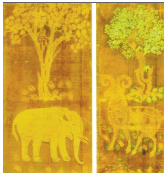
Fig. 2. Batik folding screen with tree and elephant as well as tree and goat

Wax printing was always a professional behaviour in manual workshop in the Central Plains of Tang Dynasty. In order to maintain the efficiency of printing