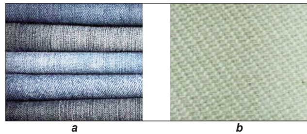
Fig. 3. The structure of: a – conventional denim fabric; b – prepared denim-type fabric

The mechanical potential, in response to the repeated stresses of traction, friction, tearing, and repeated bending, was a result of two vectors: a) the weave of the structure that gave the surface effect of the fabric presented above; and b) the fibrous composition of the yarns used, which incorporated a percentage of max 10% high modulus synthetic fibre in the fibrous mass from the high-tech polyethylene class (UHMWPE), makes the dispersion of the characteristics that contribute to the mechanical potential, to be significantly minimized, at values of the coefficient of variation not specific to the spun yarns, but specific to the multifilament yarns.