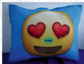
Examples of smart textile prototypes achieved by project partners (INCDTP, Ghent University)