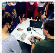
Course with VET trainees organized by Ghent University (Sept. 2020)