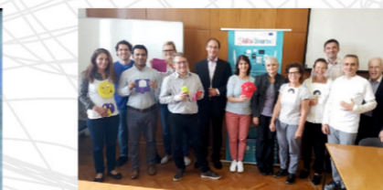
Picture from the second meeting at University Maribor - Slovenia (Sept. 2019)