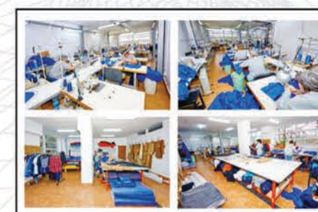
Insights from incubated company SC Xtreme Equipament SRL

ITA TEXCONF is part of the National Network for Innovation and Technology Transfer ReNITT and acts for the sustainable economic and social development of the textile sector, by ensuring access to technological performance, developing the innovative environment, introducing quality systems and developing human resources.